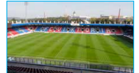
DOOSAN ARENA, PLZEŇ