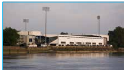
CRAVEN COTTAGE, LONDON