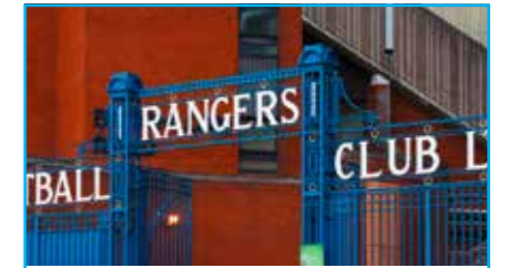
IBROX STADIUM, GLASGOW