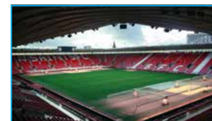
ST. MARY'S STADIUM, SOUTHAMPTON