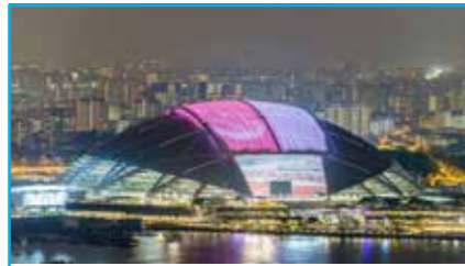
SINGAPORE SPORTS HUB