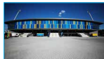
EINTRACHT STADIUM, BRAUNSCHWEIG