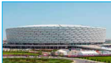
BAKU NATIONAL STADIUM