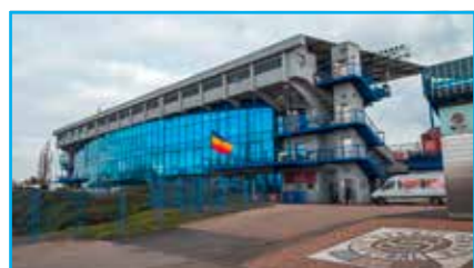
GENERALI ARENA, PLZEŇ