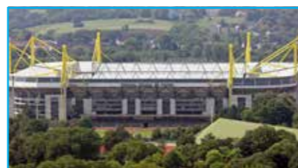
SIGNAL IDUNA PARK, DORTMUND