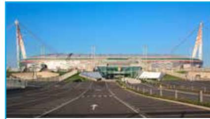
ALLIANZ STADIUM, TURIN