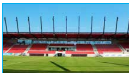
JAHN STADIUM, REGENSBURG