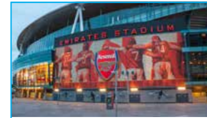
EMIRATES STADIUM, LONDON