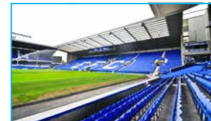
GOODISON PARK, LIVERPOOL