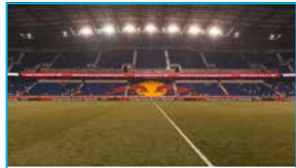
REDBULL ARENA, LEIPZIG

stadiums (1 st -3 rd league) in Germany with 830,000 seats