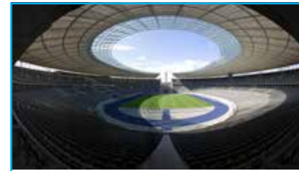
OLYMPIC STADIUM, BERLIN